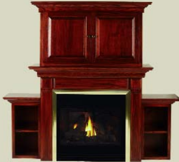
WILLIAMSBURG STRAIGHT 3 CORNER CABINET