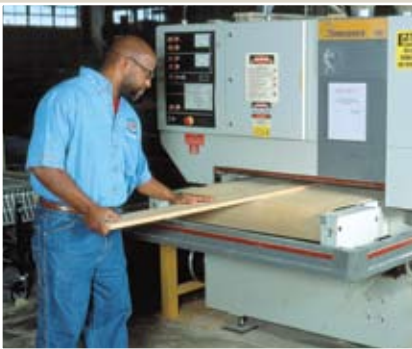
Our moulding and sanding machines use sophisticated technology to precisely shape wood to desired dimensions.