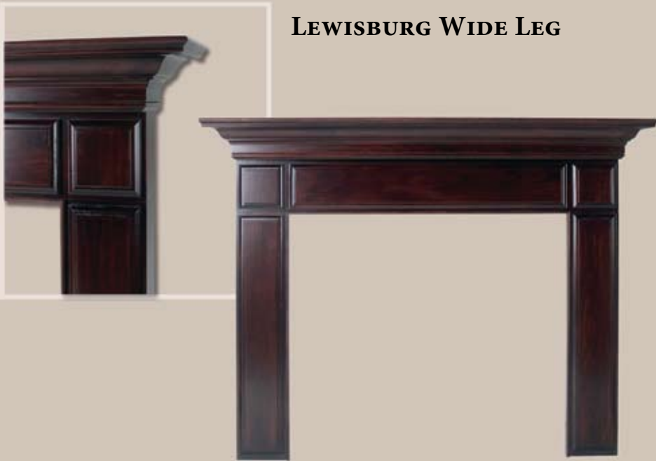
LEWISBURG WIDE LEG