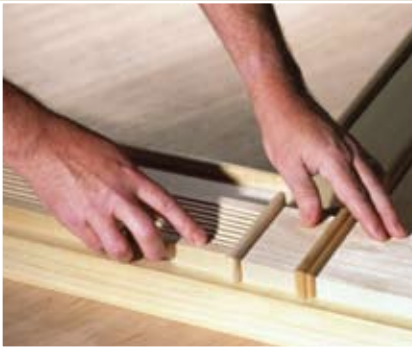
Each mantel is hand-crafted and assembled to measurement and fit specifications.