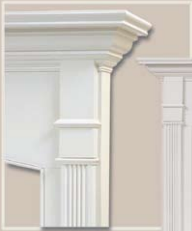
PROVIDENCE ARCH 2