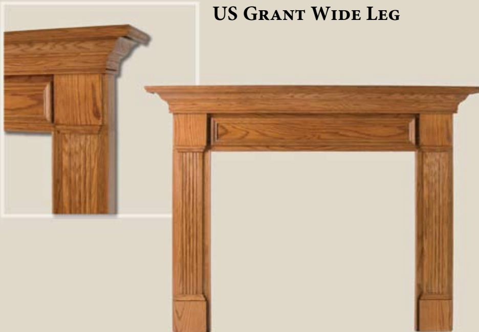
US GRANT WIDE LEG