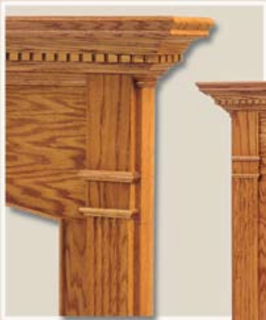
WILLIAMSBURG ARCH 4