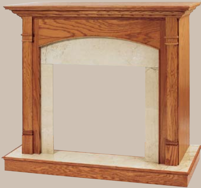
PROVIDENCE ARCH 5 CABINET