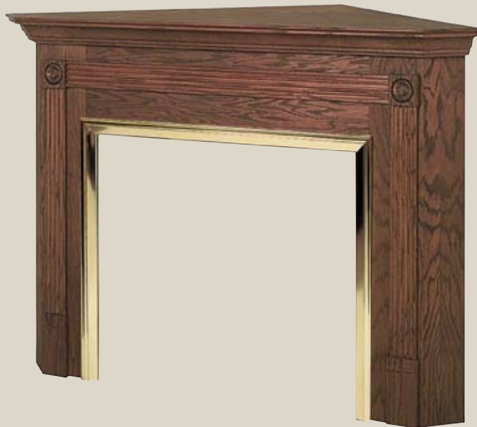
SAINT GEORGE STRAIGHT CORNER CABINET