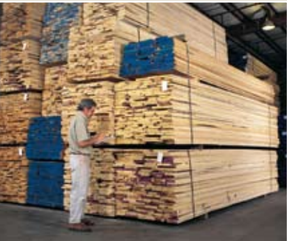
Bulk purchasing of the highest grade woods provide unrivaled consistency and quality at the lowest possible price.