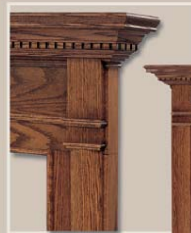
WILLIAMSBURG STRAIGHT 5