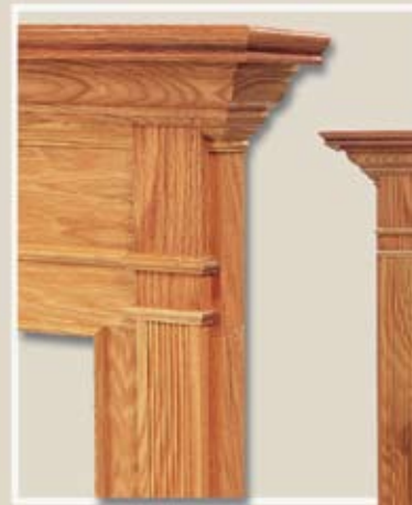
PROVIDENCE STRAIGHT 3